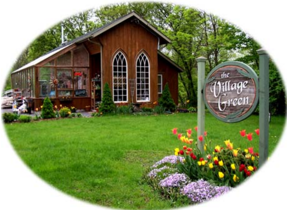
the Village Green, home of Terra Edibles